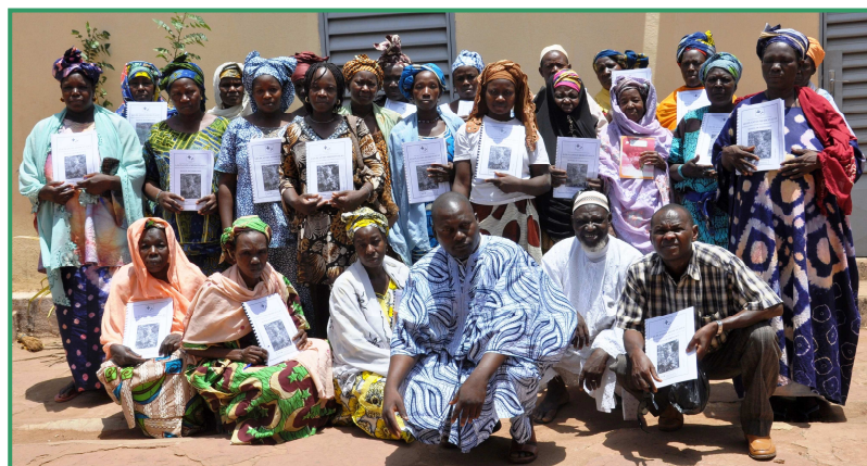
Photo n° 1 : Training of women herbalists of FEMATH (Bamako, April 2011)

The objectives of the actions, which have been developed in synergy and in partnership between Aidemet NGO and FEMATH, are to improve working conditions and incomes of women herbalists and to participate in the conservation of medicinal plants biodiversity. Direct beneficiaries of the two projects are 40 women herbalists, including 30 in Bamako and 10 in Segou.