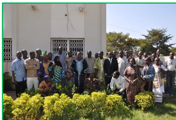
Photo 2: The group's photo

The Scientific Day got the desired results. Thirteen communications out of seventeen abstracts selected were submitted to the public. The young researchers have shown for the first time in a national scientific meeting the results of their research. The exchanges between researchers of different structures has allowed the identification of possible synergies and collaborations, to enhance research on natural substances in general, and medicinal plants in particular. The discussions are underway, on the one hand, to accompany the publication of the most interesting results, and, secondly, to use research findings to develop new safe, effective and quality controlled drugs, based on medicinal plants.