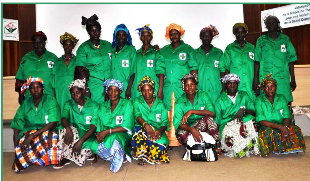
Photo 4 : The herbalist women of Bamako and Ségou beneficiaries of kiosks

After a series of questions and answers, the prospects for supporting herbalists have been widely discussed. In this context, the most important recommendations of the workshop were: (i) for herbalists, to be involved in the protection, culture and sustainable use of medicinal plants and to transmit the love for medicinal plants to younger generations; (ii) for the local authorities, to reserve adequate space for herbalists in the city markets, (iii) for the national authorities, to engage in the implementation of the