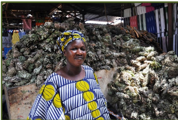
Figure 2 : Herbalist woman of Ségou (Mali)

In tropical and subtropical countries, and particularly in Mali, where aromatic plants are numerous and present a great potential for medicines and cosmetics, these energy costs are difficult to overcome, either for industrial and semi-industrial production, or for a production at the community level with intensive manpower utilisation. The electrical energy or fossil fuels are very expensive, while the use of wood or coal is not proposable because obviously it is not ecologically sustainable. The solution of energy problem for the distillation of essential oils is important for the valorisation of the sector of medicinal plants and for local development, with a direct impact on the incomes of women who are the protagonists of the plants production and distribution chain.